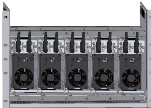
OPUS 19" 5U DC/DC Rack Converter systems 450W – 3750W