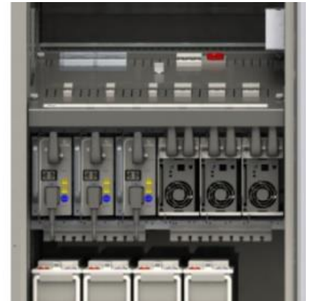
DC/DC converter modules and systems to OPUS cabinets