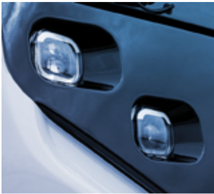
NCC® Avego as low-beam and high-beam headlight, daytime running light, indicator light and position light for COBUS buses