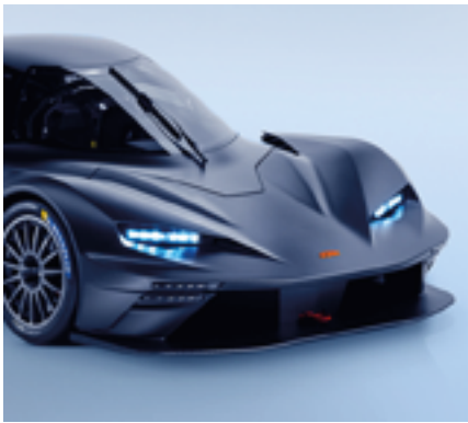
NCC® Arton as low-beam and high-beam headlight and NCC® Slim 500 as daytime running light for the KTM X-BOW