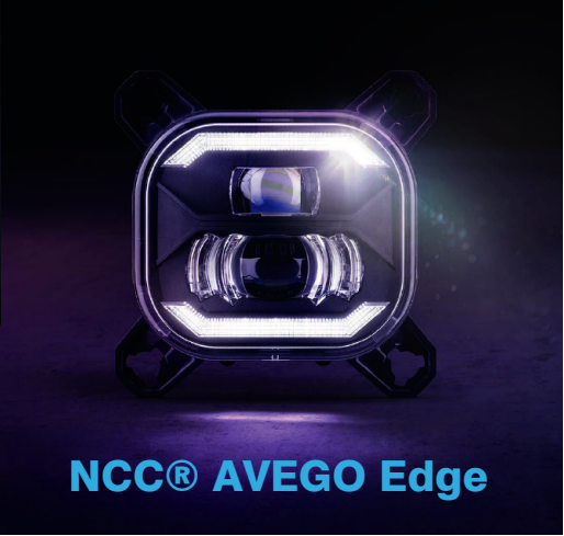
NCC® AVEGO Edge