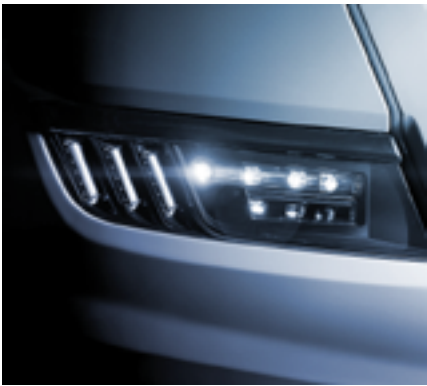
NCC® Transformer Next and NCC® Arton as low-beam and high-beam headlight for MORELO motorhomes