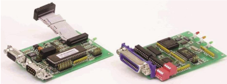
Card for inserting in power supply