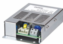
JLM & JLHM enclosed version