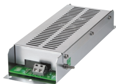
JL & JLH enclosed version