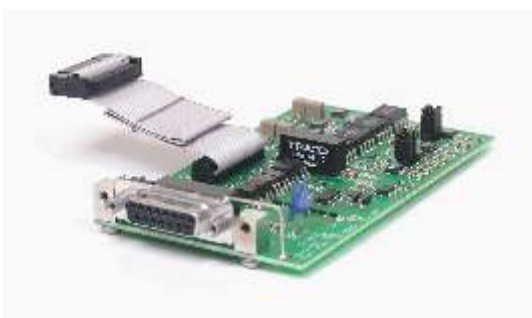
An ISO AMP CARD should be used in case of a non-floating programming source.